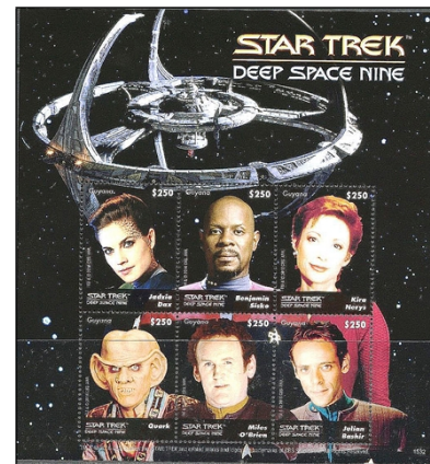
2015 – SS