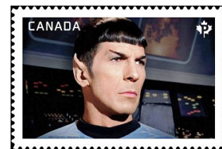
2016 CANADA (STAR TREK)