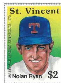
1989 ST. VINCENT (NOLAN RYAN)

HISTORICAL FACTS WITH PHILATELIC CONNECTIONS OVER THE YEARS, STAMPS HAVE BEEN ISSUED FOR TELEVISION, STAR TREK, NOLAN RYAN & BASEBALL