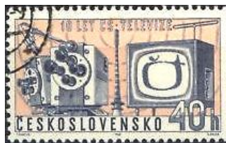
1963 CZECHOSLOVAKIA (TELEVISION SERVICE)